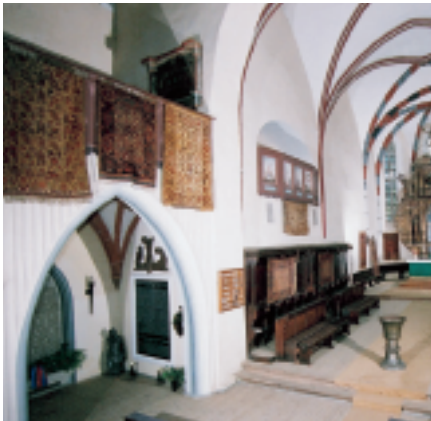
The Monastery Church, Sighişoara