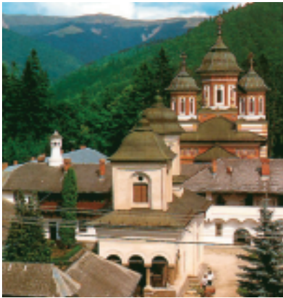
The Orthodox Monastery in Sinaia