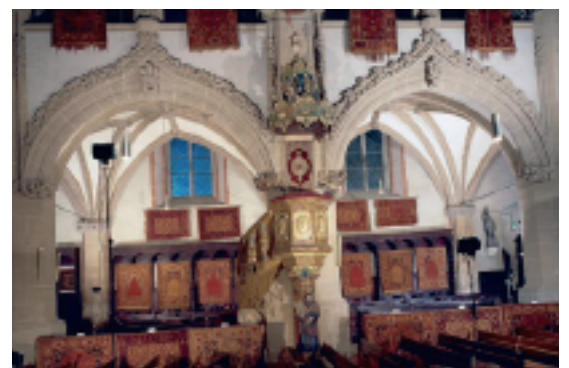
Ottoman prayer rugs in the Black Church