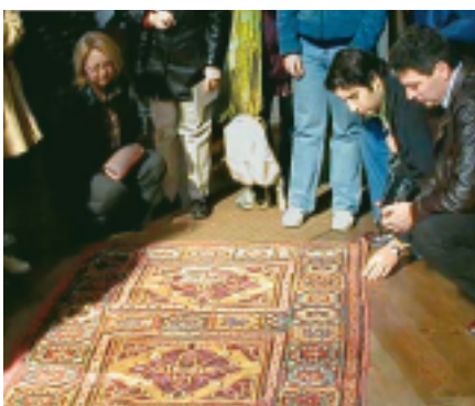
Study of a Ghirlandaio rug