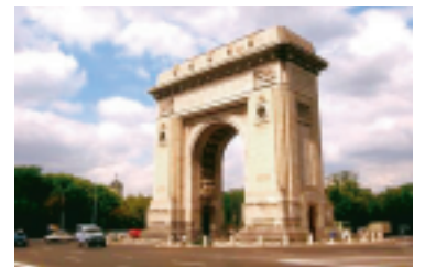
Bucharest The Triumph Arch

★ 8:00 p.m. - Dinner with a selection of Turkish and Balkanic specialities.