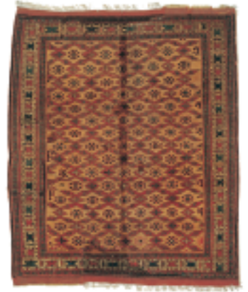
Unique Star-lattice rug - late 15th century - Sighişoara