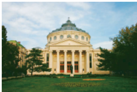
Bucharest - The Atheneum, built 1870