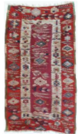
A' scoartza' from Oltenia MRP, Bucharest

★ 8:00 p.m. - Dinner in a traditional restaurant with Romanian menu.