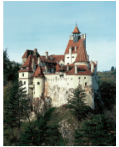
The Dracula Castle in Bran