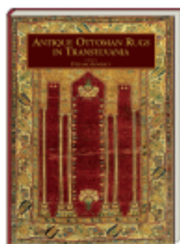
Stefano's Ionescu book showing over 300 rugs from Transylvania