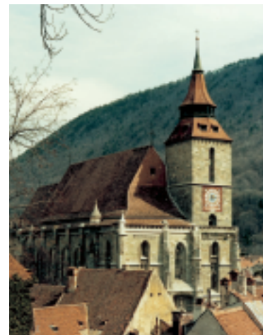
Braşov - The Black Church