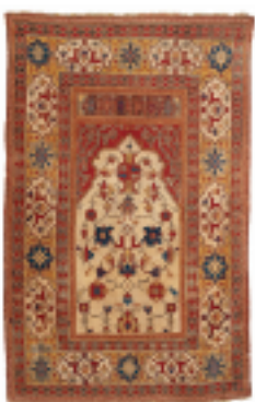
Single niche 'Transylv.', MCC