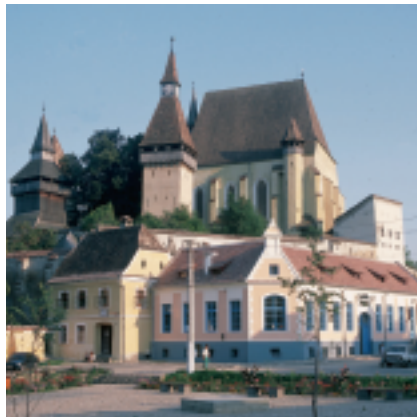
The Lutheran Church of Biertan