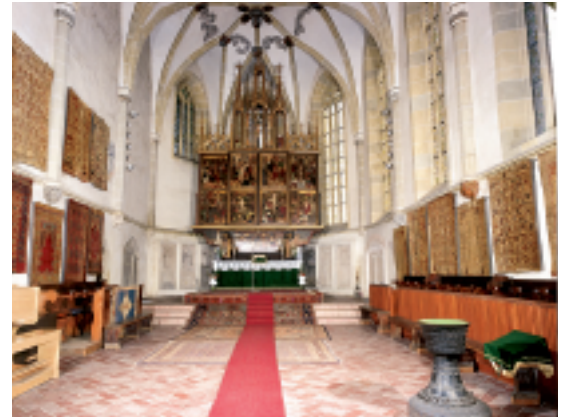
St. Margaret Church in Mediaş