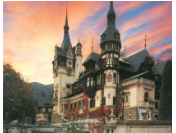
Sinaia - The Peleş Castle